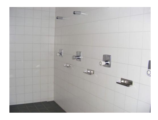
Upstairs Shower Room (Typical)