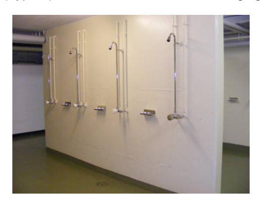
Shared Shower room