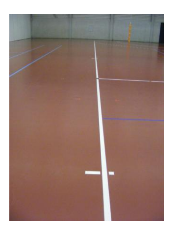
Substitution area and Timekeeper table