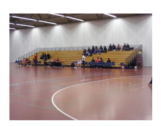
Substitution area and timekeeper table