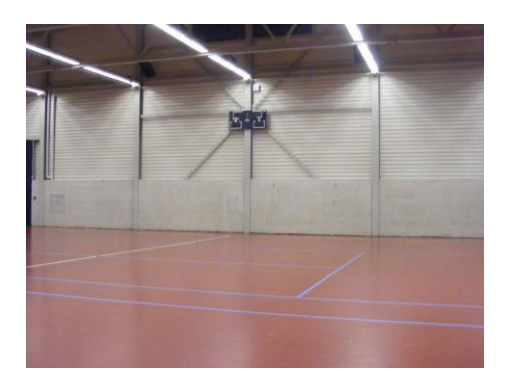
Electronic Scoreboard (Temporary)