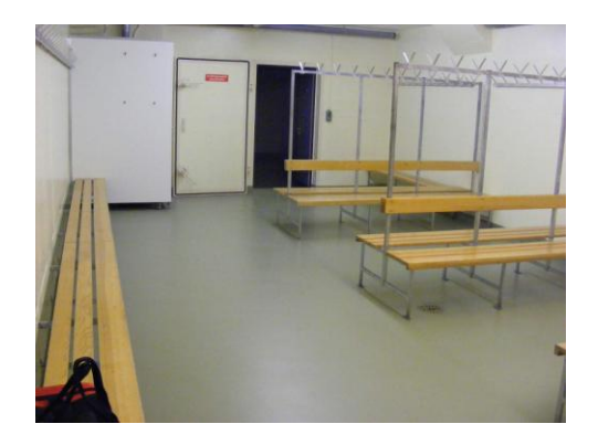
Basement Changing room (Typical)

There are 10 changing rooms and they are interlinks with both Sports Halls (Hall 1, 2 and 3) from basement and upstairs.