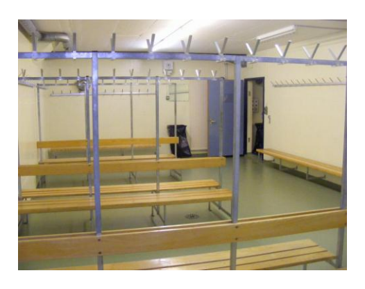
Basement Changing Room (Typical)