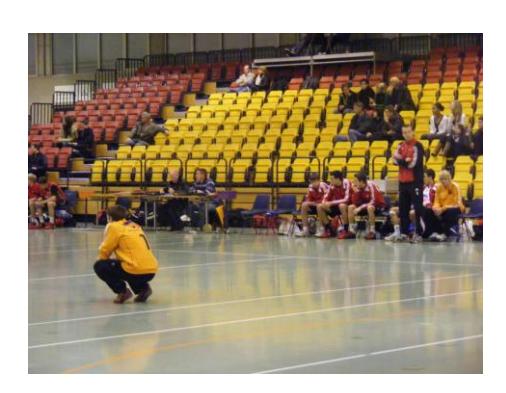
Substitution area and Timekeeper table